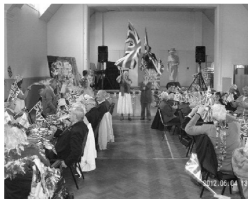
ENABLING EVERYBODY TO CELEBRATE SPECIAL EVENTS