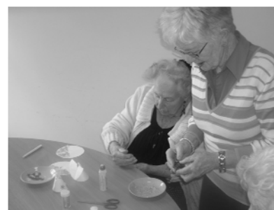
ENCOURAGING INDEPENDENCE WHILST OFFERING DISCREET SUPPORT IF NEEDED

To take advantage of the services we offer, to join our dedicated volunteers or for further information visit www.ageuk.org.uk/hytheandlyminge or call 01303 269602