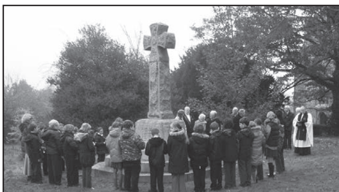
▲ The Armistice Day Service on 11.11.2011 with the children from Lyminge Primary School.

Do you have any photos of local events or local groups in action, please call 01303 862699